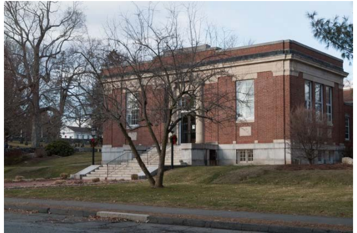
Main Street: 25 (Southborough Public Library). View NW.