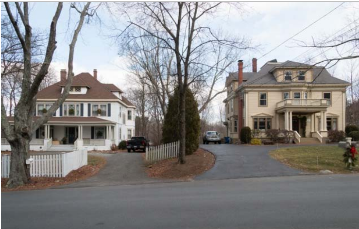
Latisquama Road: 10 and 12. View E.