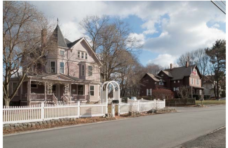
Latisquama Road: 04 and 08. View SE.