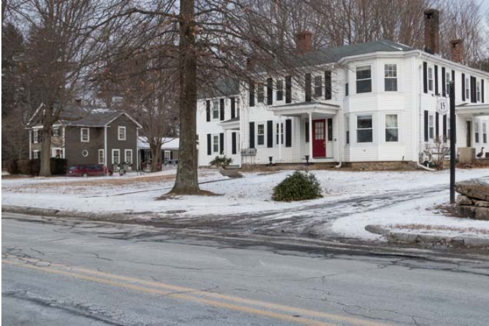
Main Street: 17 and 15. View NW.