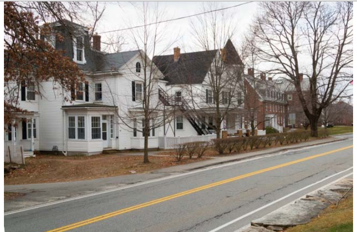
Main Street: 44, 46, 48. View SW.