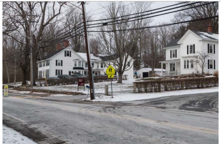
Main Street (Fay School): 33 and 31. View NW.