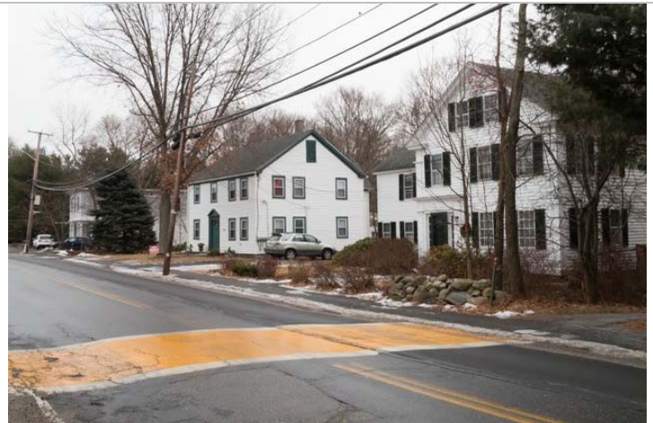
Main Street: 14, 16, 18. View SE.