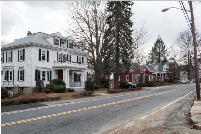
Main Street: 40 and 42. View SW.