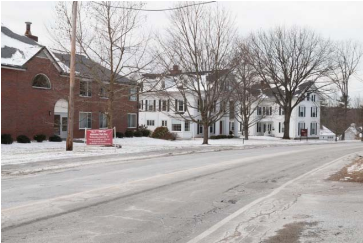
Main Street (Fay School): 50, 52, 54. View SW.