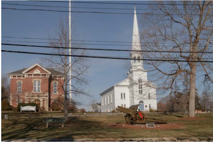
Town Common, Town House, and Second Meetinghouse, 17 and 15 Common Street. View N.