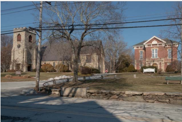
Main Street: 27-29 (St. Mark's Church) and 17 Common Street (Town House). View N.