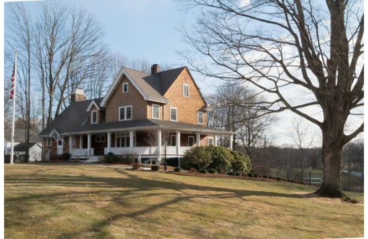
Main Street: 28 (Southborough Community House). View SE.