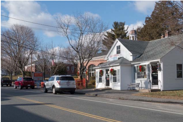
Main Street: 09, 05 (Southborough Firehouse), 03. View NW.